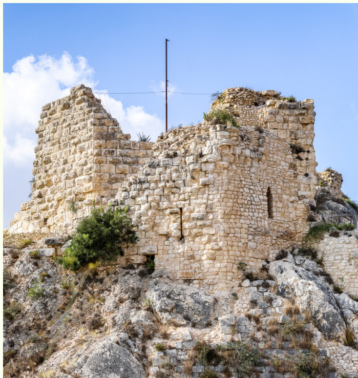
The remains of the ancient Beaufort Castle (The Beautiful Castle) also known locally as Qal'at Al-Shaqif in Arnoun, Lebanon.

Conversely, field data confirms Hezbollah's continued expansion of operations, whether through launching rockets toward settlements in the Galilee or developing the use of drones, including those equipped with night-vision technologies. This relatively diminishes the traditional importance of controlling high altitudes and redefines the balance