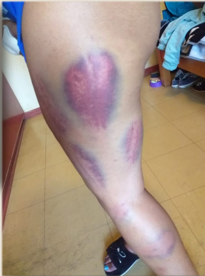
A student from the Swaziland College of Technology who was heavily assaulted by the police.

population of admitted undergraduate students.